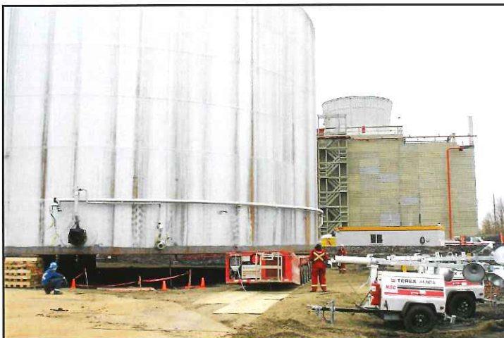
STORAGE TANK RELOCATION