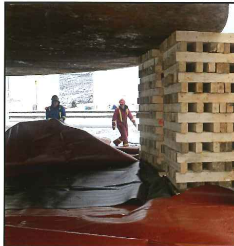
RELEASE PREVENTION BARRIER INSTALLATION