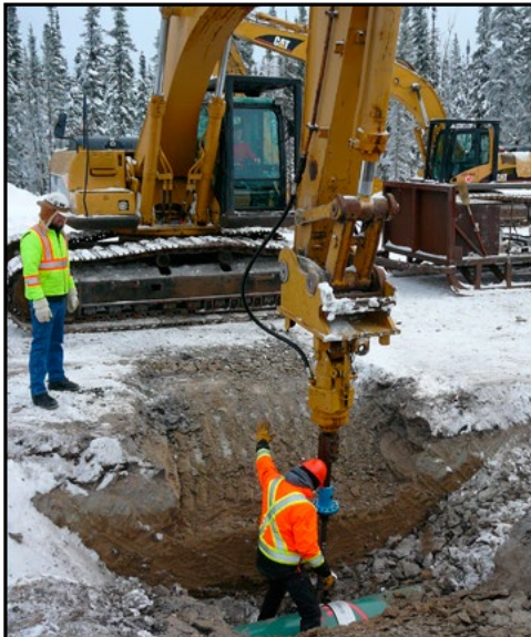
INSTALLATION IN NORTHERN CANADA

The professional support you need...when you need it.