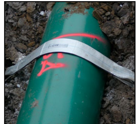
INSTALLED PIPELINE ANCHOR ASSEMBLY