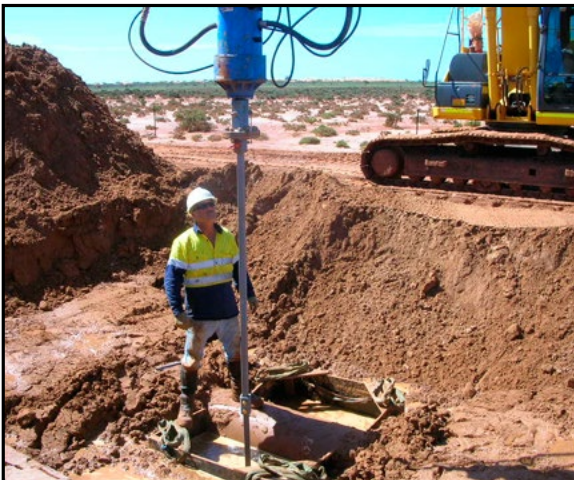
INSTALLATION IN AUSTRALIA

Our advanced anchor designs, combined with our exclusive, non-corroding, low stress polyester pipe saddles, provide unparalleled performance and longevity, regardless of the installation environment.