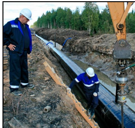
INSTALLATION IN RUSSIA