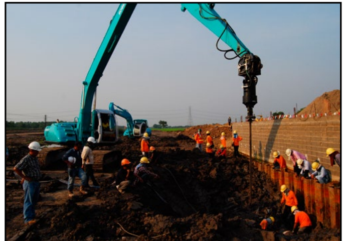
INSTALLATION IN THAILAND